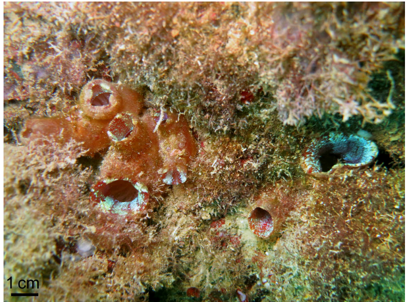
Figure 2. Herdmania momus aggregation in Rosh Haniqra marine nature reserve on natural rocky reef. July 2013.

Our field surveys and recreational diver reports helped us describe a non-indigenous ascidian that is increasing its ability to colonize natural substrates along the Mediterranean coast of Israel, and expanding its habitat range by establishing in shallower waters (< 10 m).