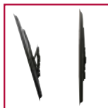
Low-profile design at 1" (25mm) with tilt lock at 0°