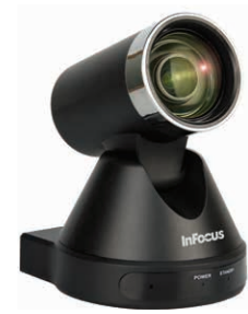
RealCam PTZ Camera

Thunder Speakerphone (INA-TH150): VoiceAware anti-echo & noise-reducing technology for any size meeting room.