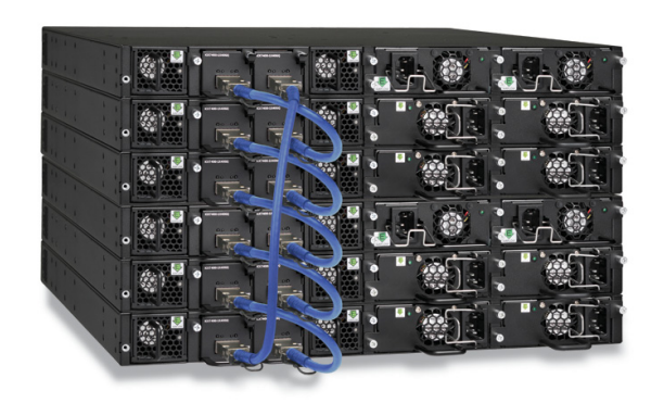
Figure 1. Up to 12 Brocade ICX 7450 switches can be stacked together using two full-duplex QSFP+ 40 Gbps ports that provide a fully redundant backplane with 960 Gbps of stacking bandwidth.