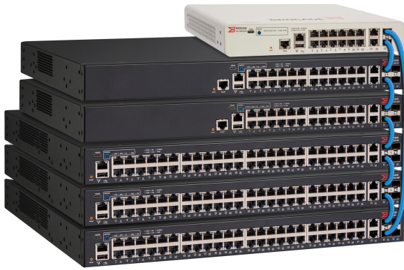
Figure 3. Up to eight Brocade ICX 7150 switches can be stacked together into a single logical switch using standard SFP+ 10 Gbps ports and copper cables or optics.