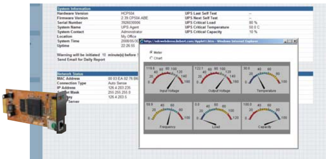
Optional Liebert IntelliSlot Web Card provides SNMP and web-based management