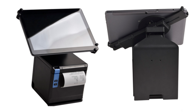
Printer & Tablet not included