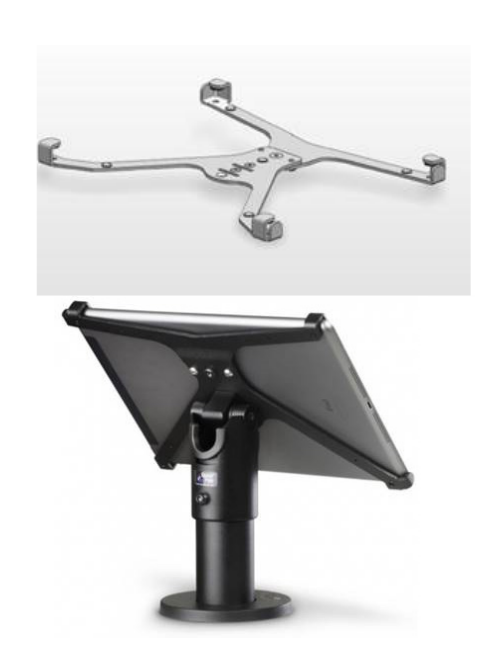
Stand* & Tablet not included

* Duratilt X Frame Stand (PN: MSSPDTP101)