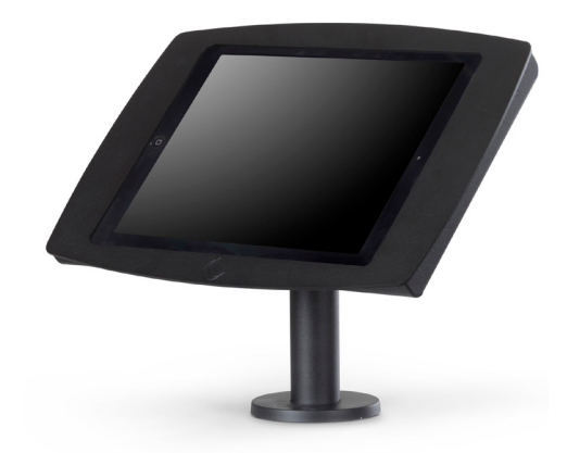
Stand* & Tablet not included

* SpacePole Select Pole Curved (PN: MSSPSPM10202)