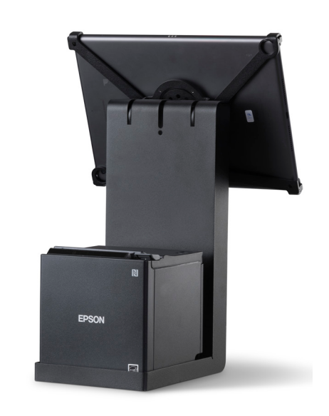
Printer & Tablet & Frame not included