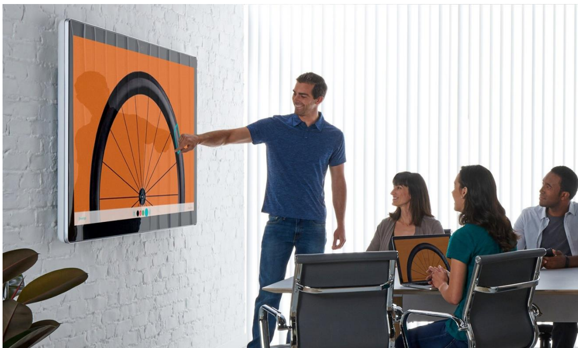
Figure 1. White Boarding Capability on the Cisco Webex Board 70

The Cisco Webex™ Board is an all-in-one device that provides everything you need to collaborate with your teams in physical meeting rooms. You can wirelessly present, white board, and have video and audio calls. And it securely connects to your virtual teams through the Cisco Webex service, via your Cisco Webex Teams app, so you can take your meetings and content on the road.