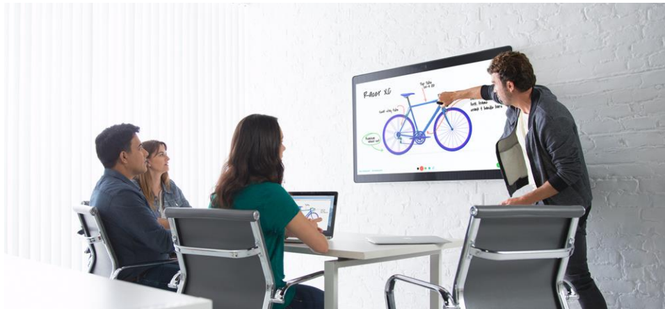
Figure 1. White Boarding Capability on the Cisco Webex Board 55

The Cisco Webex™ Board is an all-in-one device that provides everything you need to collaborate with your teams in physical meeting rooms. You can wirelessly present, white board, and have video and audio calls. And it securely connects to your virtual teams through the Cisco Webex service, via your Cisco Webex Teams app-enabled devices, so you can take your meetings and content on the road.