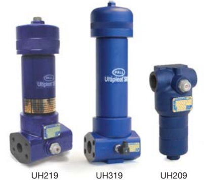
Return Line Series