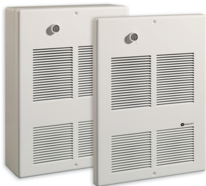
With surface mounting box