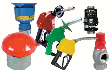
Above Ground Products

Setting the industry standard in retail and commercial fueling solutions worldwide since 1892.