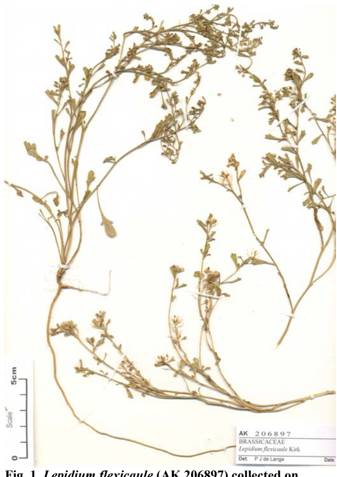
Fig. 1. Lepidium flexicaule (AK 206897) collected on Saddle Island, western Great Barrier Island in January 1989 - the first collection in the northern half of the North Island for 55 years.

Previously this threatened (de Lange et al. 2009) indigenous New Zealand species had been considered extinct in northern New Zealand, with the only extant North Island record being a small population at Stent Road, on the Taranaki coastline (Peet et al. 2003). Prior to this discovery the last known record of L. flexicaule from the Auckland Region was a gathering made by Lucy Cranwell from Bethells Beach (Te Henga) on the west coast in 1934 (AK 100102), and the last from the east coast by Thomas Cheeseman from Rangitoto Island in 1882 (AK 4481). There are no previous records from Great Barrier Island or its associated islands.