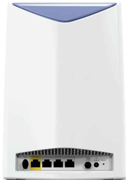
Orbi Pro Router (SRR60)