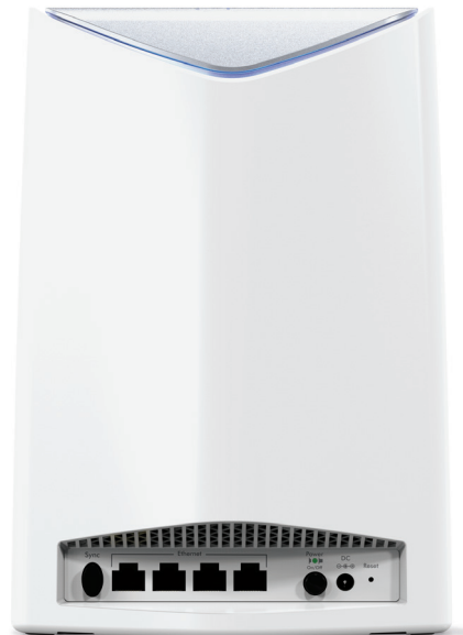
Orbi Pro Satellite (SRS60)