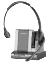
Savi Office, W0300