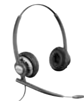
EncorePro 720 Digital