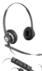
EncorePro 725 USB