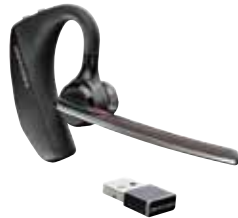
Voyager 5200 UC