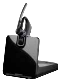
Voyager Legend CS