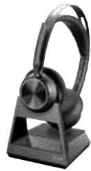
Voyager Focus 2 Office