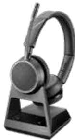
Voyager 4220 Office, 2-Way Base