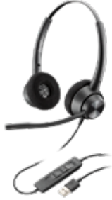
EncorePro 320 USB