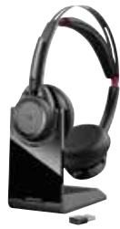
Voyager Focus UC