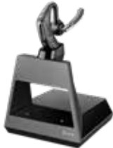
Voyager 5200 Office, 2-Way Base