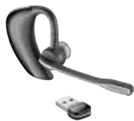
Voyager PRO UC