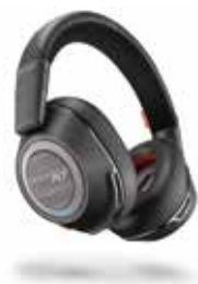
Voyager 8200 UC, black