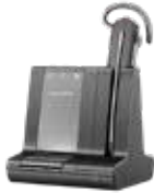
Savi 8240 Office