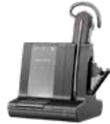
Savi 8245 Office