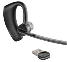
Voyager Legend UC