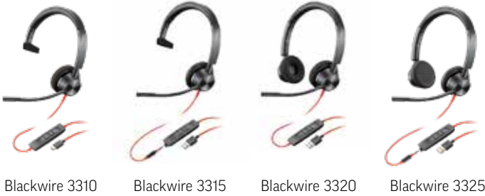
Blackwire 3310 Blackwire 3315 Blackwire 3320 Blackwire 3325