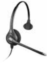
Supraplus wideband HW251N, Noise-canceling