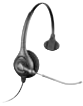
Supraplus wideband HW251, Voice Tube