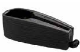
Voyager Edge Charge Case