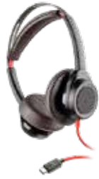
Blackwire 7225, espresso