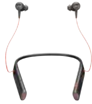
Voyager 6200 UC