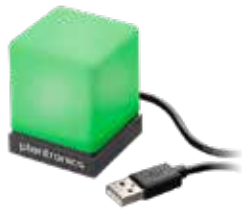
Plantronics Status Indicator