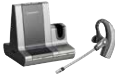
Savi Office, W0200/201