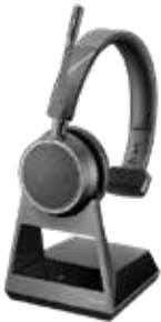
Voyager 4210 Office, 1-Way Base