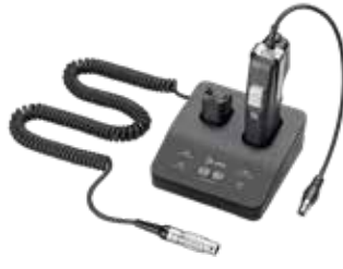
CA22CD Dual Channel