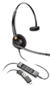
EncorePro 515 USB