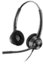
EncorePro 320 QD