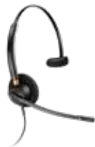
EncorePro 510 Digital