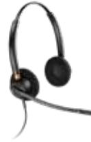
EncorePro 520 Digital