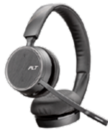
Voyager 4220 UC