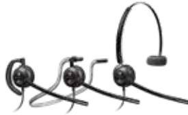
EncorePro 540 Digital