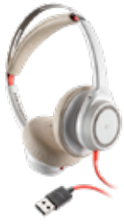
Blackwire 7225, sand