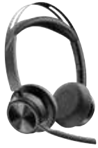
Voyager Focus 2 UC