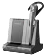
Savi Office, W0100/101