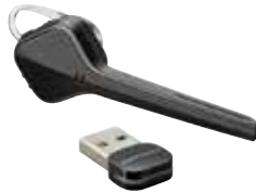
Voyager Edge UC