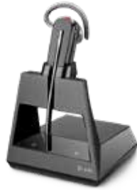
Voyager 4245 Office