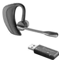
Voyager PRO UC, WG200/WG201/B