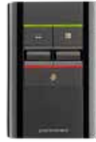
MDA500 QD Series

MDA220 USB Multi-Device adapter Telephone interface cable Quick Start Guide