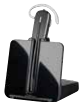
CS545-XD™, Convertible+ Deluxe Charging Kit