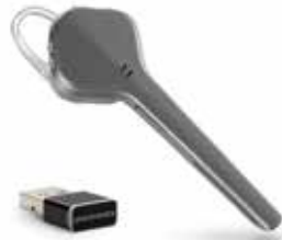
Voyager 3200 UC