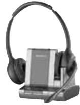
Savi Office, W0350