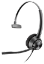
EncorePro 310 QD