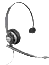
EncorePro 710 Digital