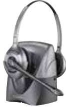
Supraplus Wireless CS361N