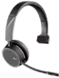
Voyager 4210 UC