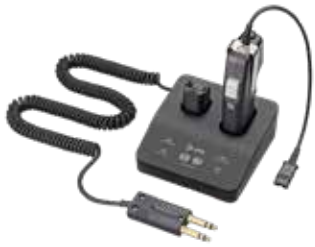
CA22CD Single Channel