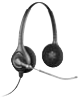
Supraplus wideband HW261, Voice Tube