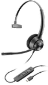
EncorePro 310 USB