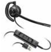
EncorePro 535 USB