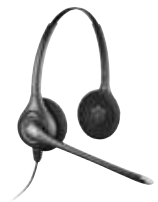
Supraplus wideband HW261N, Noise-canceling