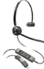
EncorePro 545 USB