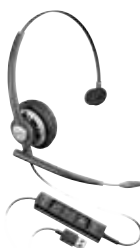
EncorePro 715 USB