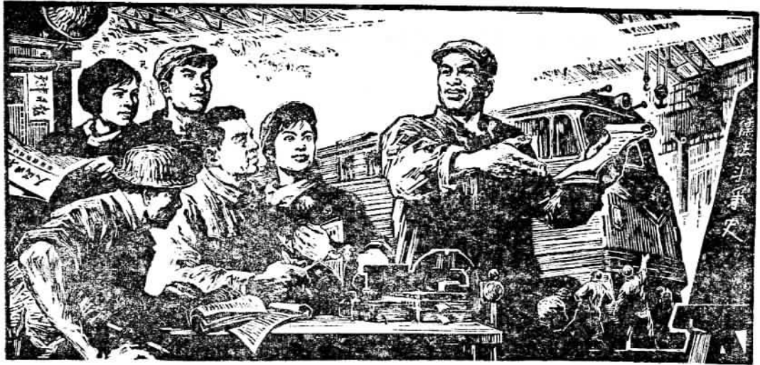
A workers' theoretical group.

The bourgeois careerist and conspirator Lin Piao more than once wrote reactionary scrolls bearing these words: "Of all things, this is the most important: to restrain oneself and return to the rites," and he regarded "to restrain oneself and return to the rites" as the most important thing of all. "Restraining oneself" was his way of having his gang cover up its counter-revolutionary ambition and engage in intrigues and conspiracies, and he also