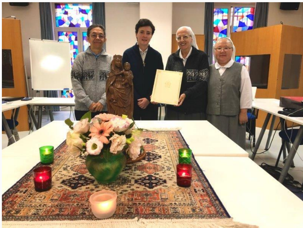
The FMI General Council with the Apostolic Brief