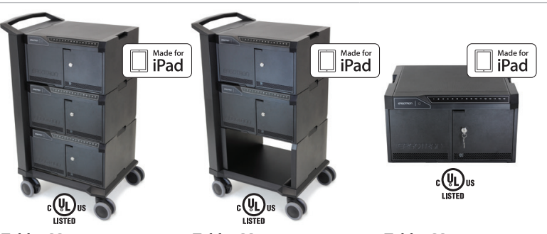
Tablet Management Cart 48