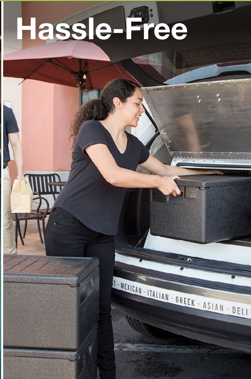
EH903 - PREPARA BLACK RECTANGULAR INSULATED POLYPROPYLENE FOOD CARRIER 1/1 GN