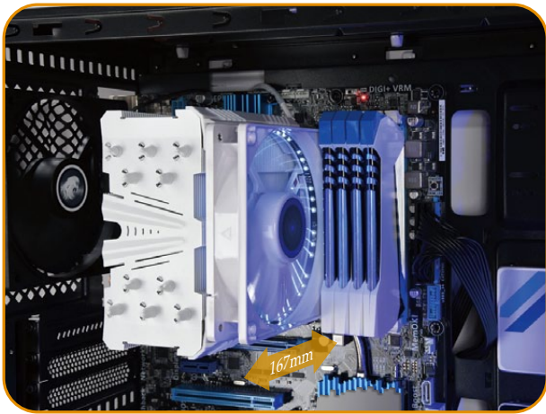
Supports CPU cooler up to 167mm in height

Quick-release ODD bay covers and HDD trays for easy installation.