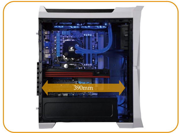
Supports the latest long VGA card (390mm Max.)