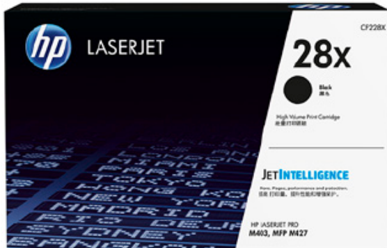
Original HP Toner cartridge with JetIntelligence

Bring out the best in your MFP. Print more consistent, high-quality pages than ever before, 2 using specially designed Original HP Toner cartridges with JetIntelligence. Count on better performance, higher energy efficiency, and the authentic HP quality you paid for—something the competition simply can't match. 2