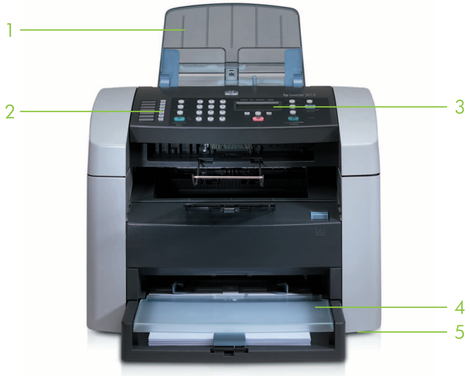
HP LaserJet 3015 All-in-One front shown

120-speed dials and 110 group dials for handy faxing