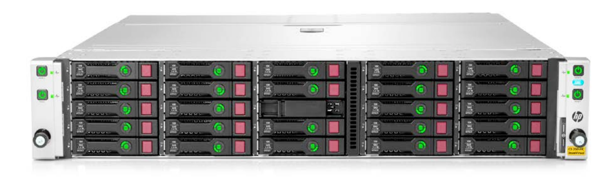
Chassis, front view with 24 drives