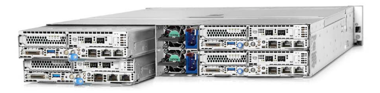
Chassis, back view with 4 nodes