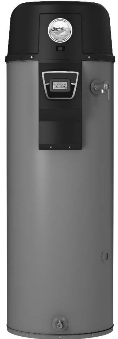
50 Gallon Model Shown

**In residential applications. Reduced warranty in commercial applications.