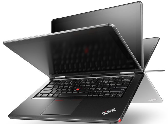
Lenovo ThinkPad Yoga