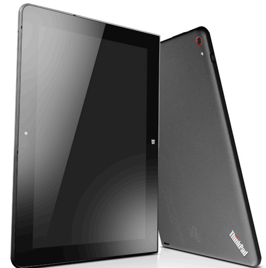
Lenovo ThinkPad 10