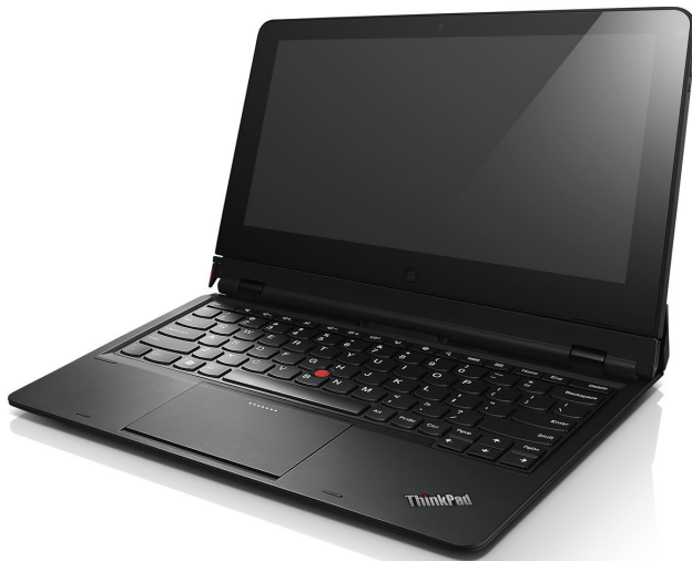
Lenovo ThinkPad Helix (Notebook mode)