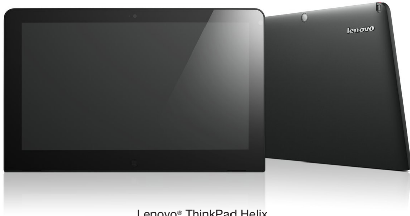
Lenovo® ThinkPad Helix (Tablet mode)