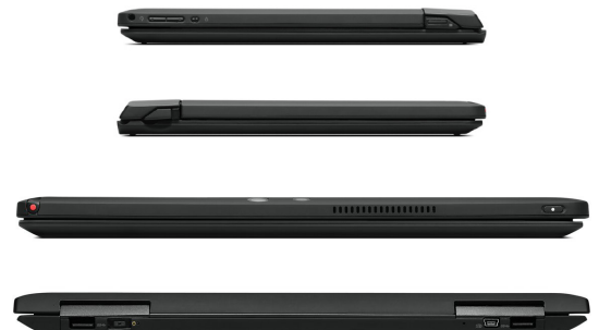
Lenovo ThinkPad Helix