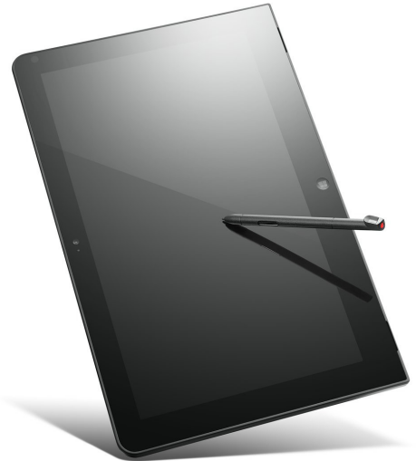
Lenovo ThinkPad Helix (Tablet mode) with ThinkPad Helix Digitizer Pen 0A33910