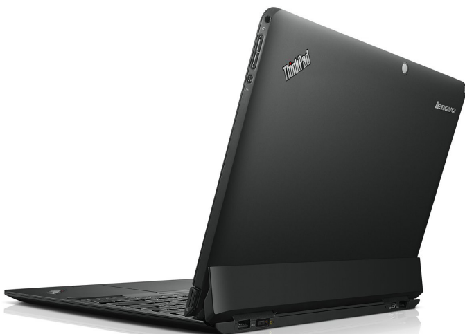
Lenovo ThinkPad Helix (Notebook mode)