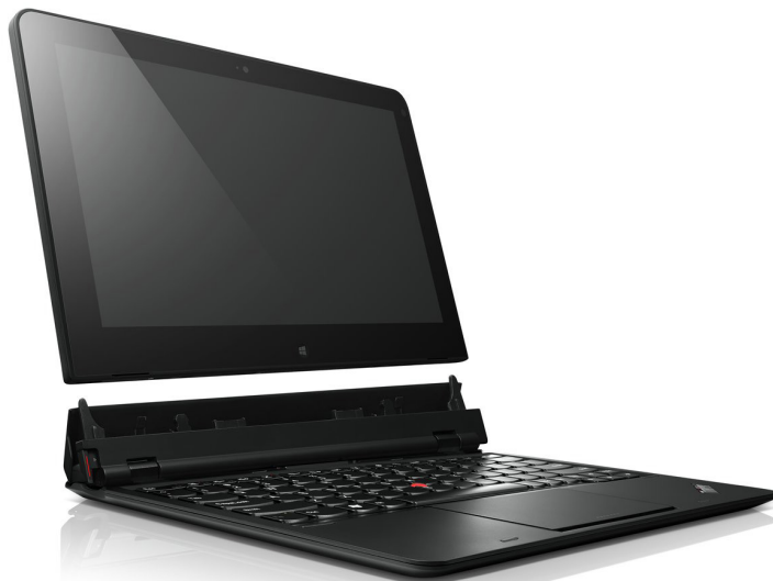
Lenovo ThinkPad Helix