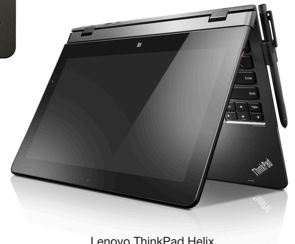
Lenovo ThinkPad Helix