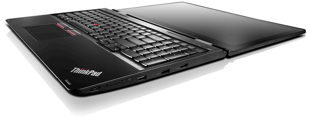
Lenovo ThinkPad Yoga 15