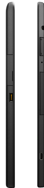
Lenovo ThinkPad 10