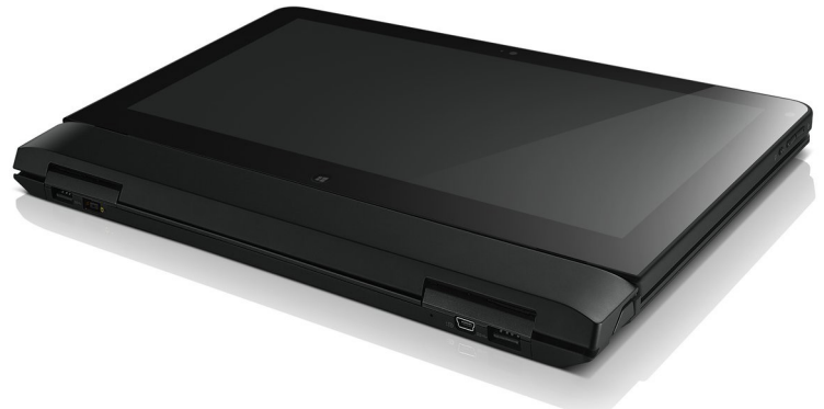
Lenovo ThinkPad Helix (Tablet+ mode)