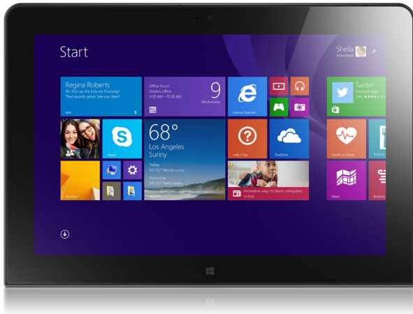
Lenovo ThinkPad 10