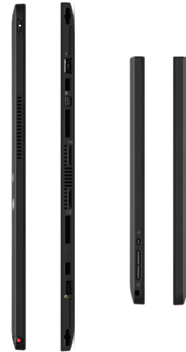
Lenovo ThinkPad Helix (Tablet only)