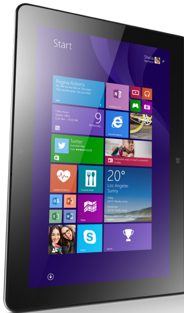
Lenovo ThinkPad 10