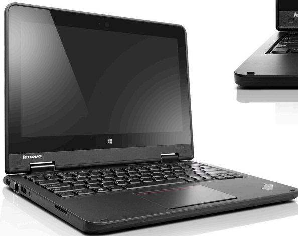
Lenovo ThinkPad Yoga 11e