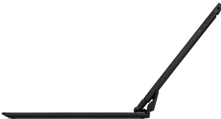
Lenovo ThinkPad Helix (Notebook mode)