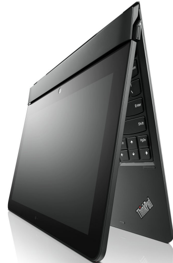
Lenovo ThinkPad Helix