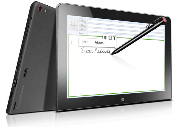
Lenovo ThinkPad 10