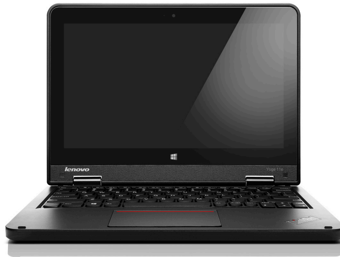
Lenovo ThinkPad Yoga 11e