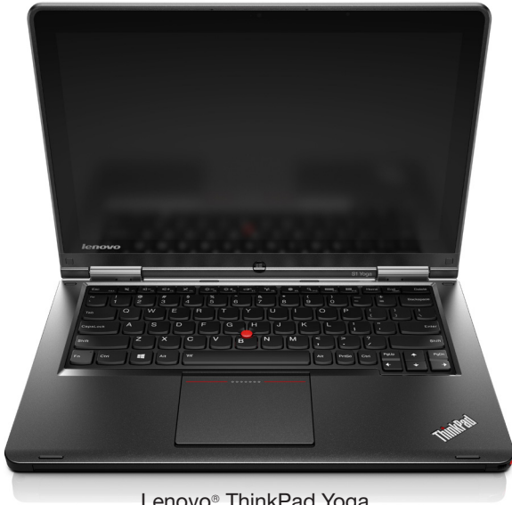
Lenovo® ThinkPad Yoga