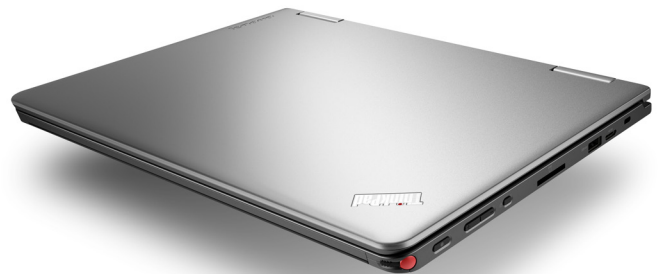
Lenovo ThinkPad Yoga