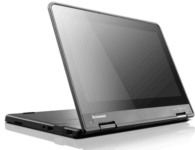
Lenovo ThinkPad Yoga 11e Chromebook