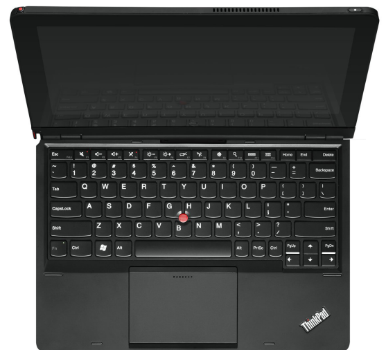
Lenovo ThinkPad Helix (Notebook mode)