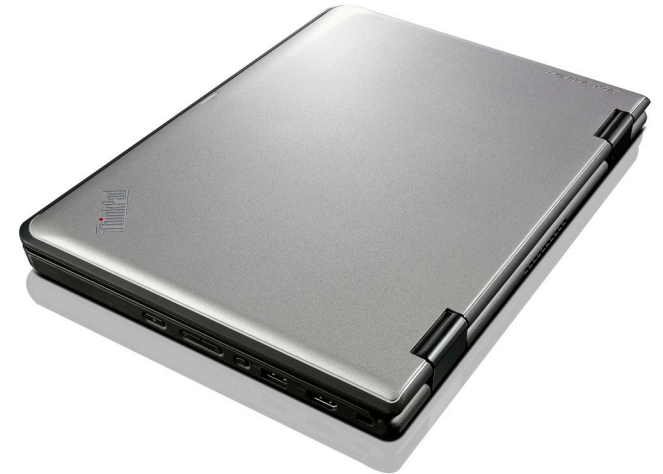
Lenovo ThinkPad Yoga 11e (2 nd Gen)