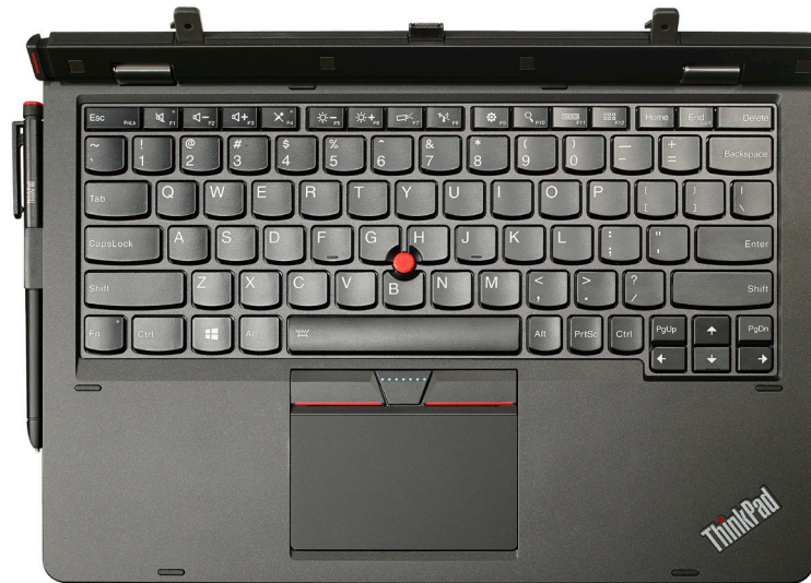
Lenovo ThinkPad Helix