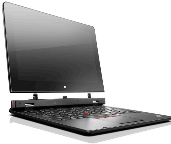
Lenovo® ThinkPad Helix