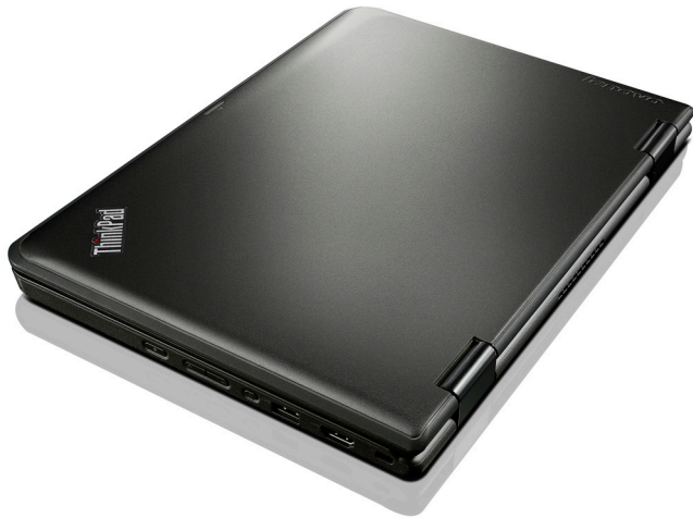
Lenovo ThinkPad Yoga 11e (2 nd Gen)