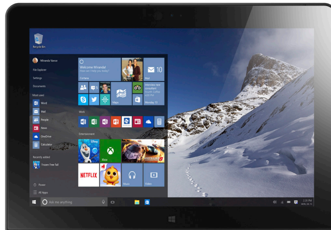
Lenovo ThinkPad 10