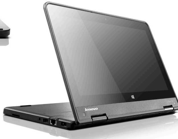
Lenovo ThinkPad Yoga 11e (2 nd Gen)