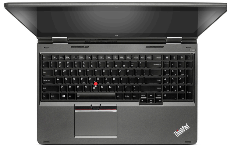
Lenovo ThinkPad Yoga 15