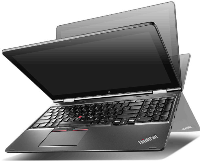
Lenovo® ThinkPad Yoga 15