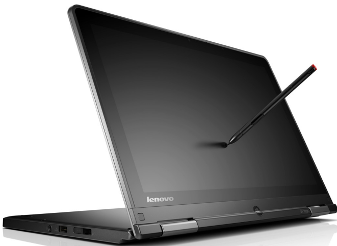
Lenovo ThinkPad Yoga