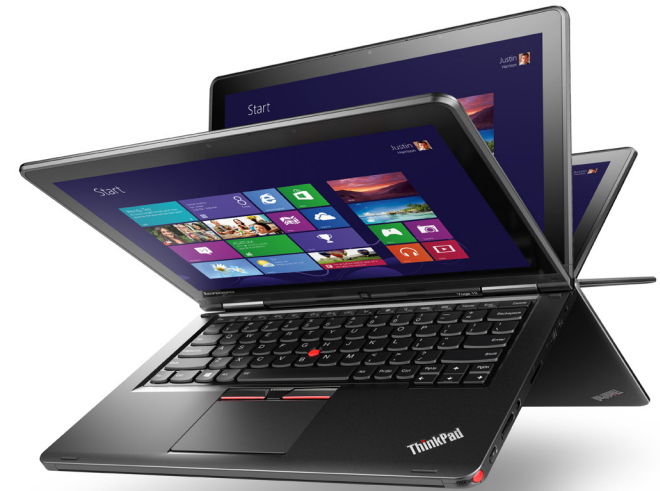
Lenovo ThinkPad Yoga 12