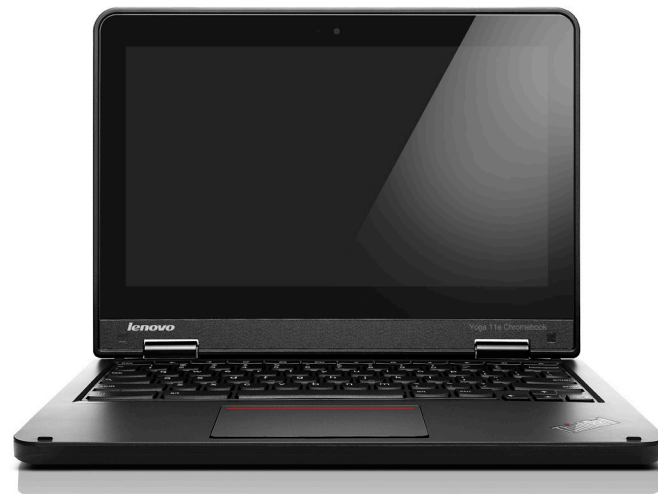
Lenovo ThinkPad Yoga 11e Chromebook