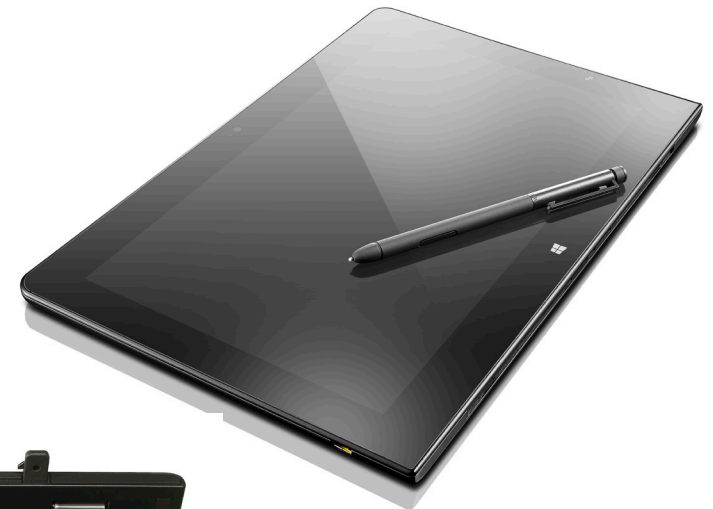
Lenovo ThinkPad Helix