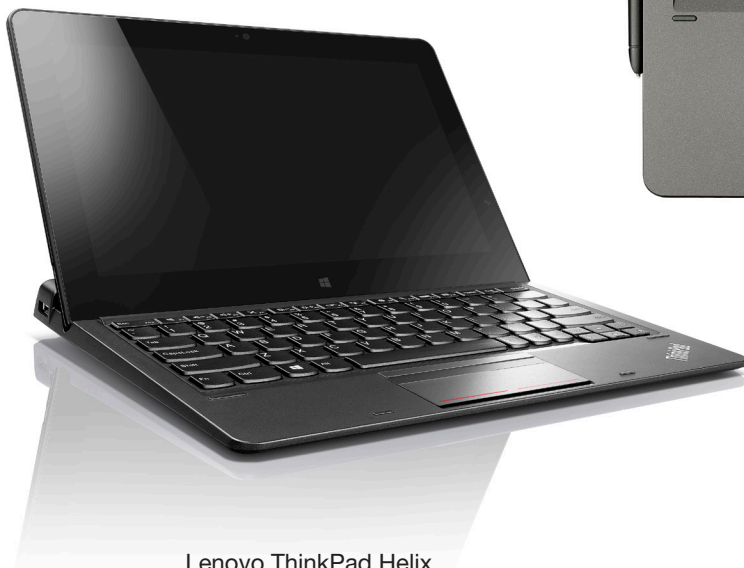
Lenovo ThinkPad Helix