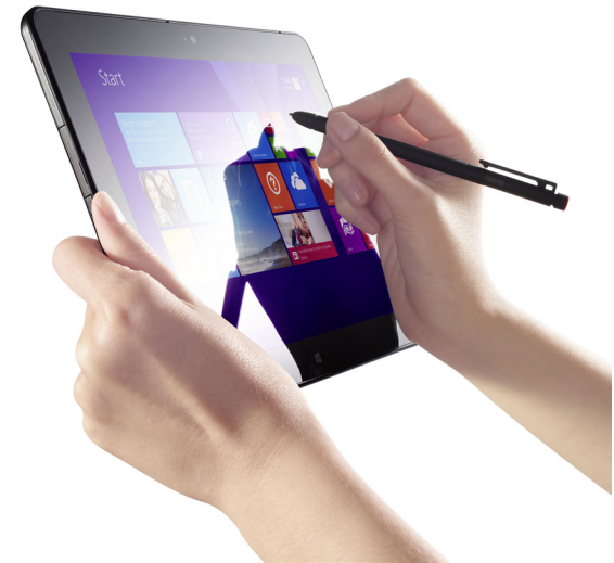
Lenovo ThinkPad 10