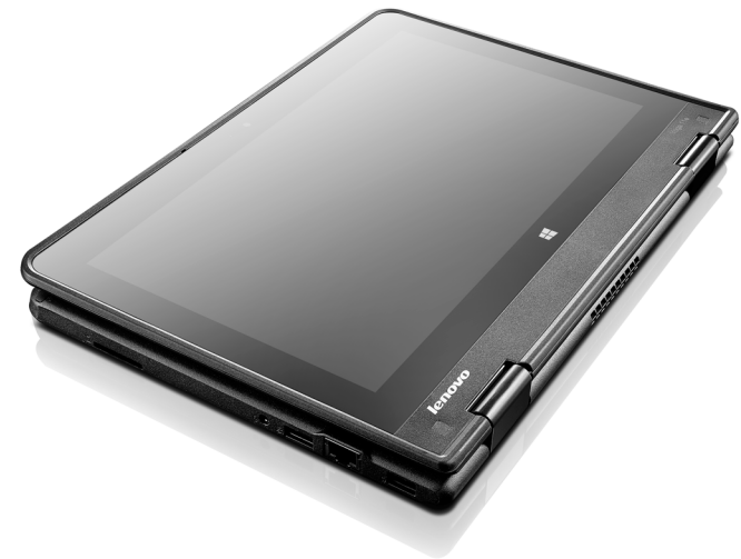
Lenovo ThinkPad Yoga 11e (2 nd Gen)