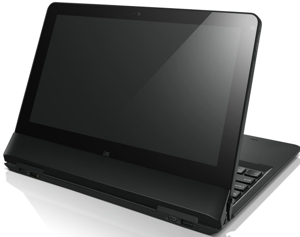
Lenovo® ThinkPad Helix (Stand mode)