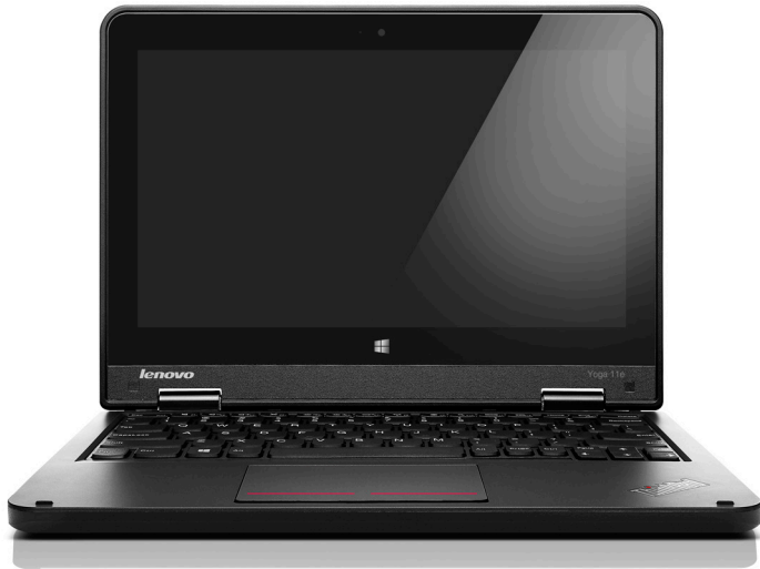
Lenovo® ThinkPad Yoga 11e (2 nd Gen)