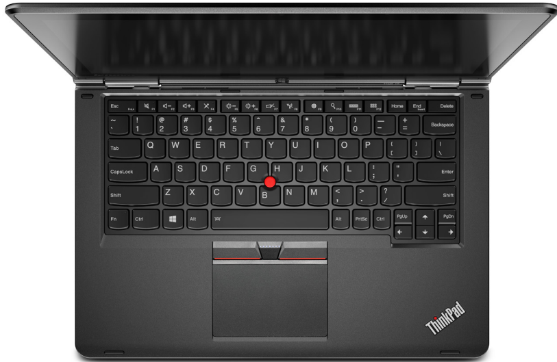
Lenovo® ThinkPad Yoga 12