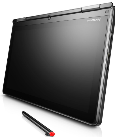
Lenovo ThinkPad Yoga