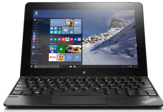
Lenovo ThinkPad 10