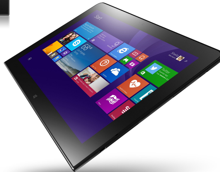
Lenovo ThinkPad 10