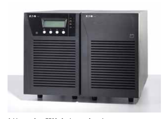
Add up to four EBMs for hours of runtime