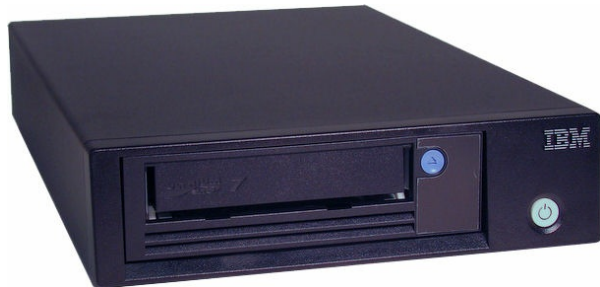
Figure 2. TS2270 Tape Drive for Lenovo

The following figure shows the TS2270 Tape Drive.