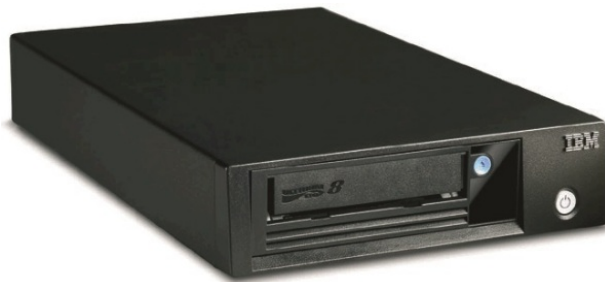
Figure 1. TS2280 Tape Drive for Lenovo

The LTO Ultrium Tape Drives from Lenovo are excellent choices if you use tape drives that require larger-capacity or higher-performance tape backup.