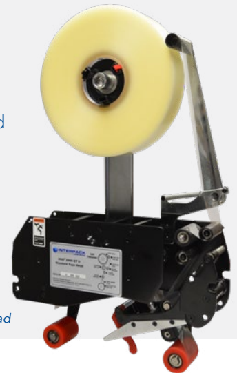
ET 2Plus tape head

When you compare features, benefits and value, Interpack™ Case Sealers are the right choice for operators, plant engineers, maintenance and purchasing.