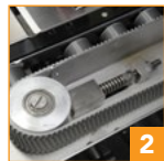
Self-tensioning & self-tracking drive belts simplify belt replacement