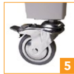
Optional swivel & locking casters