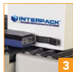
Stainless steel self-centering in-feed guides for simple case size setup