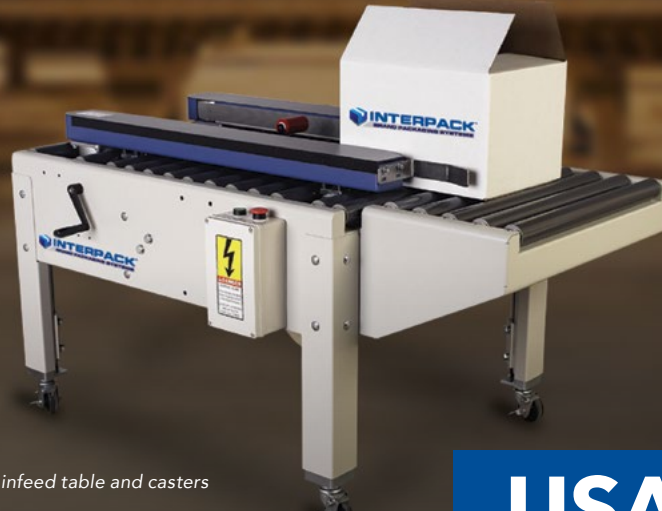
Shown with optional infeed table and casters