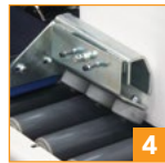
Optional spring loaded in-feed guide fully closes the bottom major flaps