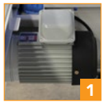
Twin 1/3 HP motors to process cases up to 85 lbs