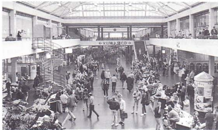
The central concourse of the University.

Bielefeld, easily accessible from all directions by motor-