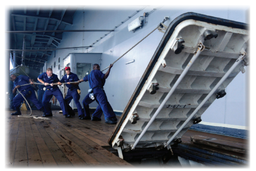
PACIFIC OCEAN (Aug. 15, 2008) Sailors assigned to the engineering repair division aboard the amphibious command ship USS Blue Ridge (LCC 19) raise an external hatch to perform maintenance on the watertight gasket and moving parts. Blue Ridge is the flagship for Commander, U.S. 7th Fleet.