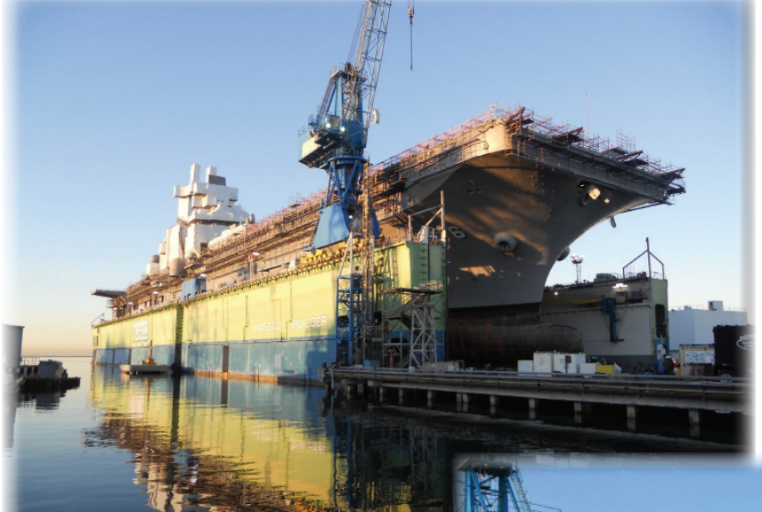
USS Bonhomme Richard in dry dock December 1. 2010.

It involves OPNAV N95 and N96, who now own the wholeness game. That's because the maintenance requirement in a budget is turned over to them to look at it from a wholeness perspective, and to decide whether the maintenance budget is right, whether or not it's whole and it gets done what it needs to get done.