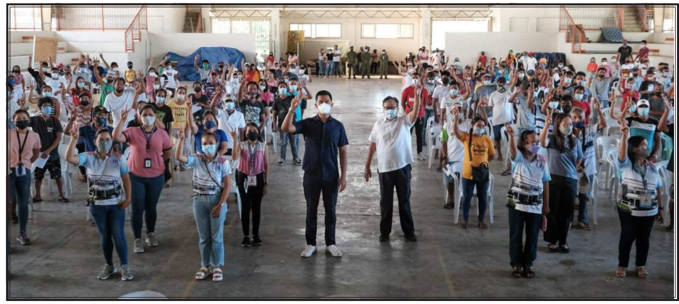
A total of 1,518 beneficiaries received their payout through the Department of Social Welfare and Development Aid to Individuals in Crisis Situation (DSWD-AICS) during a simple ceremony held at Currimao, Ilocos Norte last October 19. Governor Matthew Marcos Manotoc commended the municipal government officials of Currimao headed by Mayor Edward Quilala, for their initiative on directly requesting aid from the DWSD.