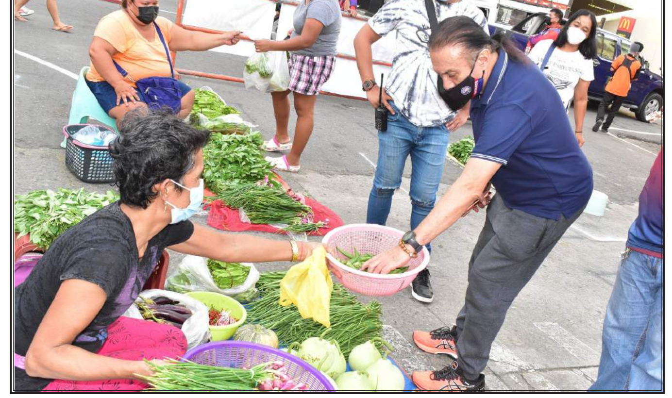
TIENDA TI RABII. After observing the smooth operation of the newly-opened Tienda ti Rabii (Night Market), which operates daily except Sunday from 4 pm to 8 pm at the Laoag public market, City Mayor Michael Marcos Keon (right) becomes an instant customer at the vegetable section.