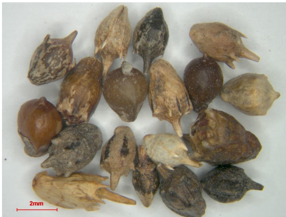
Ambrosia spp. : fruits and seeds

International Association of Feedstuff Analysis Section Feedstuff Microscopy 2019