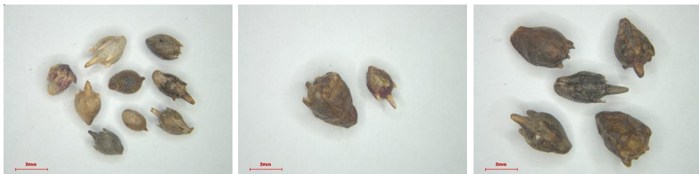
Ambrosia spp. : Fig. 4-6: different size of fruits