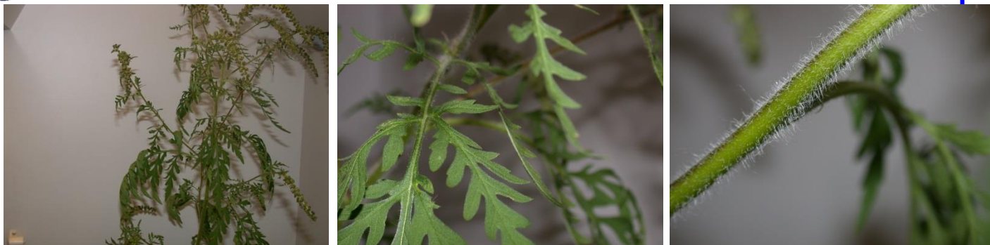
Ambrosia spp. : Pictures of plant, leaves and stem (Fig. 9-11)