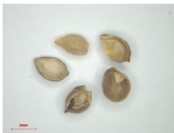
Ambrosia spp. : Fig. 7: seeds, naked and with parts of the pericarp