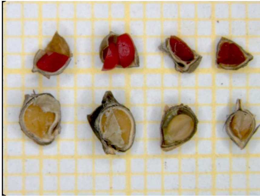
Ambrosia spp. : Fig 12.: Tetrazoliumtest: red seeds alive, uncoloured seeds dead