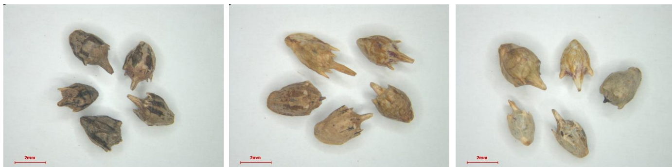
Ambrosia spp. : Fig. 1-3: different colours (from dark to light brown) of fruits

All pictures made by stereomicroscope under 6x magnification, showing the different colours (Fig. 1-3) and size (Fig. 4-6) of the fruits of Ambrosia spp. , the seed naked and with parts of the pericarp (Fig.7) and some damaged seeds (Fig. 8).