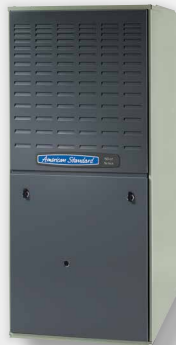
Silver 80h Single-Stage

High end comfort, efficiency and durability, all at a value. The Silver Series provides your home with just that. Plus, every model in this series comes with the American Standard commitment to quality you expect.