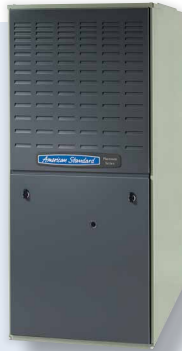
Platinum 80 Variable-Speed, Communicating

It's called the Platinum Series for a reason. With AccuLink™ capability, continuous Comfort-R™ mode and an array of other innovative features, this Series gives your home both a high level of comfort and a high level of efficiency.