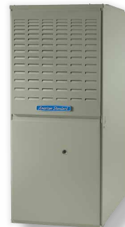
American Standard 80