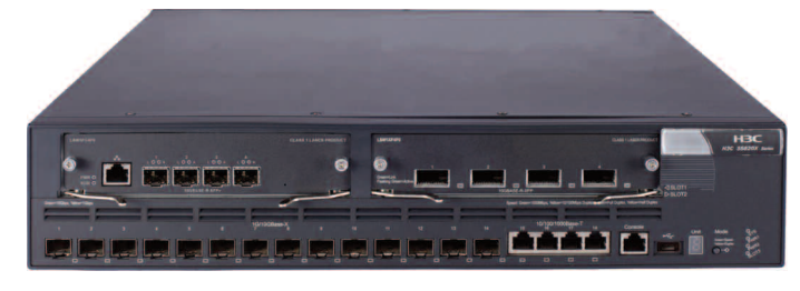
H3C 5820X-28C with FCoE Module - provides line-rate, low-latency, 10 Gigabit Ethernet and Fibre Channel over Ethernet (FCoE) connectivity for data center access layer I/O consolidation