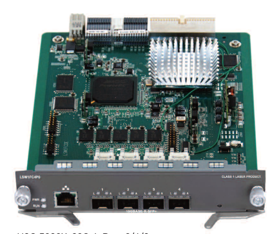
H3C 5820X-28C 4-Port 8/4/2 Gbps FCoE Module