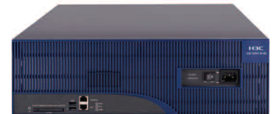
H3C MSR 30-60 Router