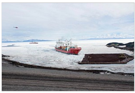
Download High Resolution

150125-N-ZZ999-002 MCMURDO STATION (January 25, 2015) The Military Sea-Lift Command chartered container ship MV Ocean Giant makes its approach to the ice pier at McMurdo Station prior to the start of port cargo handling evolutions in support of Operation Deep Freeze 2015. Deep Freeze is an annual U.S. Pacific Air Forces-led joint interagency mission to provide logistical and transportation support to the National Science Foundation and the U.S. Antarctic Program (USAP). Joint Task Force-Support Forces Antarctica coordinates strategic inter-theater airlift, tactical deep field support, aeromedical evacuation support, search and rescue response, sealift, seaport access, bulk fuel supply, port cargo handling, and transportation requirements for USAP.