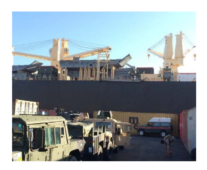
(Font = 10 pt Arial, Rows will adjust automatically for more content)