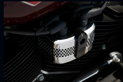
Coil Cover Kit