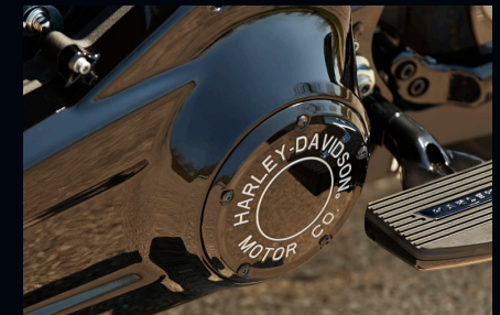
Harley-Davidson Motor Co. Derby Cover