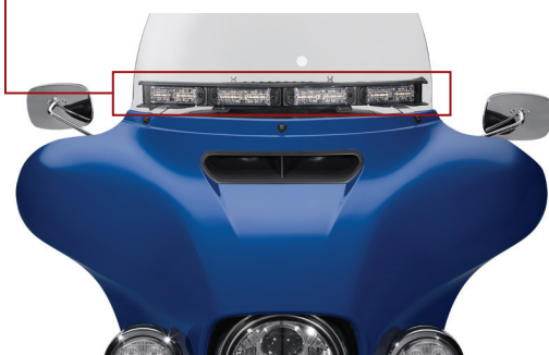
5 Windshield Light Array 68000288