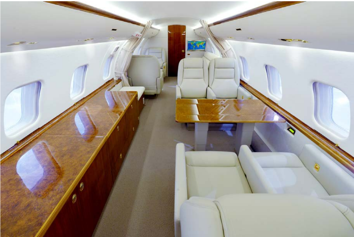
Mid Cabin Looking Aft with Dual Kibitzer Seats Closed