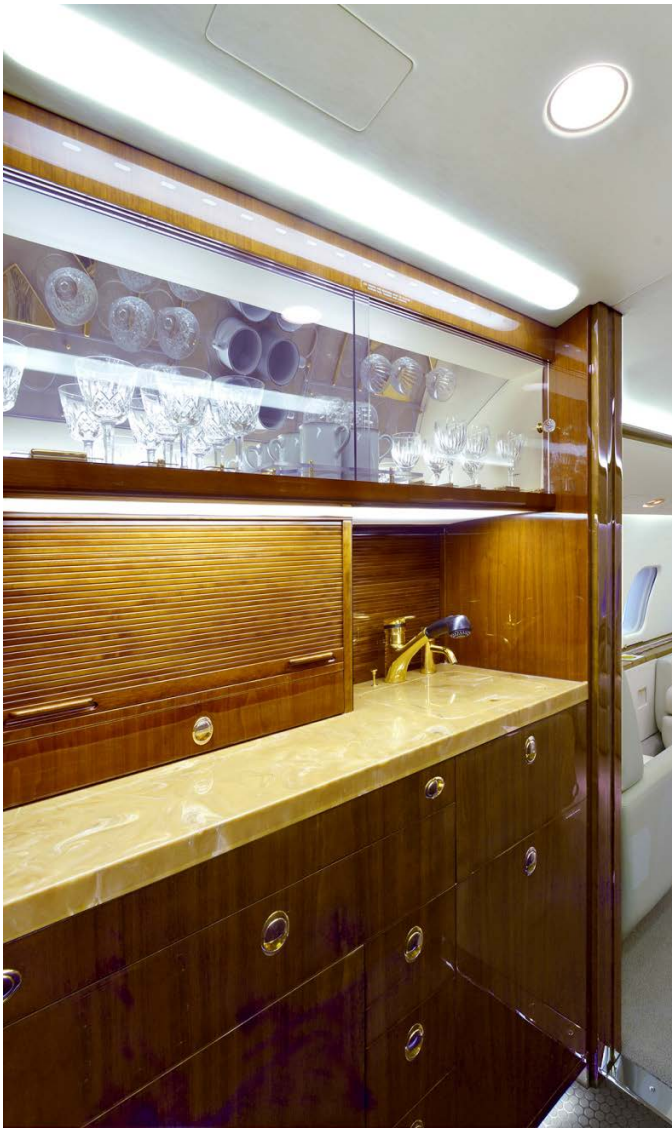
Right Side of Forward Galley