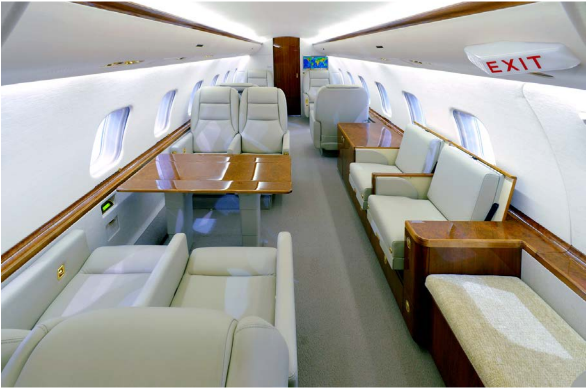
Mid Cabin Looking Forward with Dual Kibitzer Seats Open