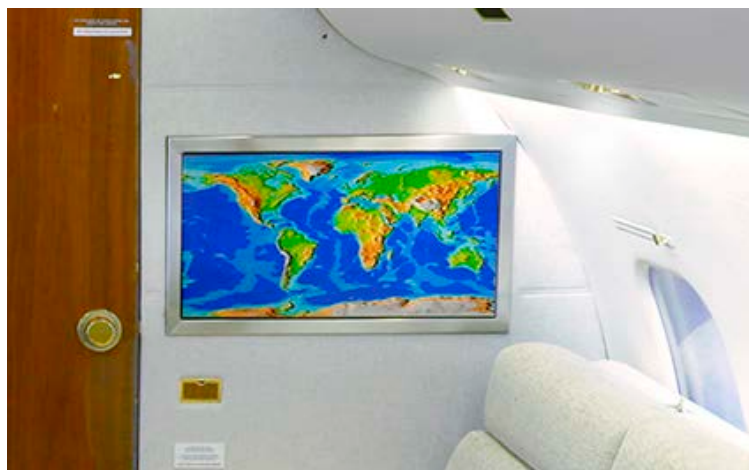
Aft 26" LCD Monitor