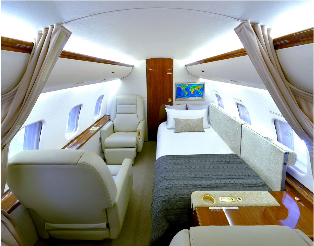
Aft Cabin with Berthable Divan