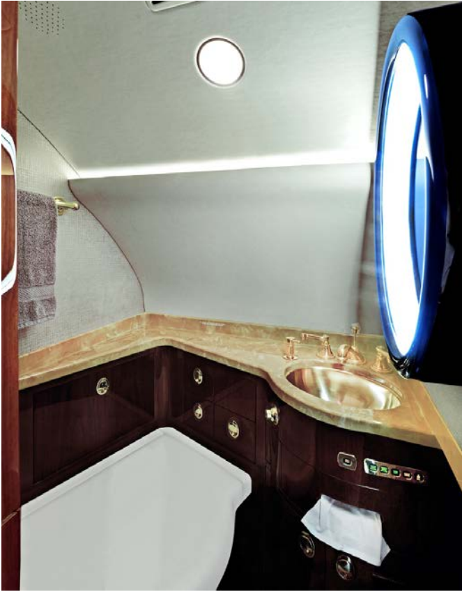
Forward Crew Lavatory