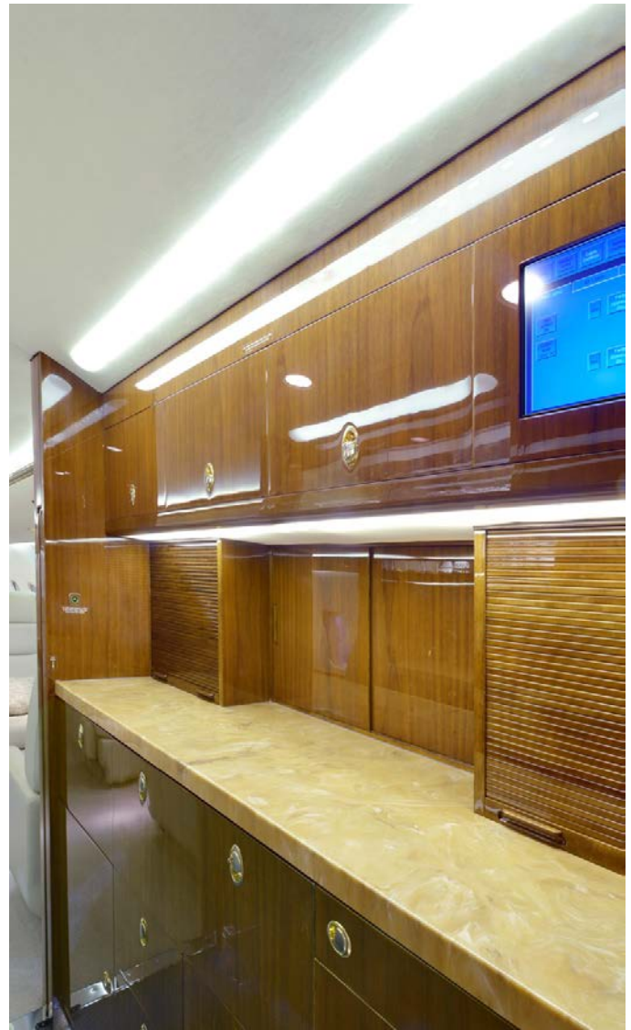
Left Side of Forward Galley