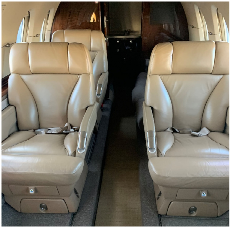
Forward Cabin looking Aft

This aircraft features a beautiful 8 passenger executive interior. The forward vestibule includes a left-hand galley and wardrobe. The main cabin follows featuring a 4-place club and an aft 3-place divan facing a single seat completed by an aft lavatory.