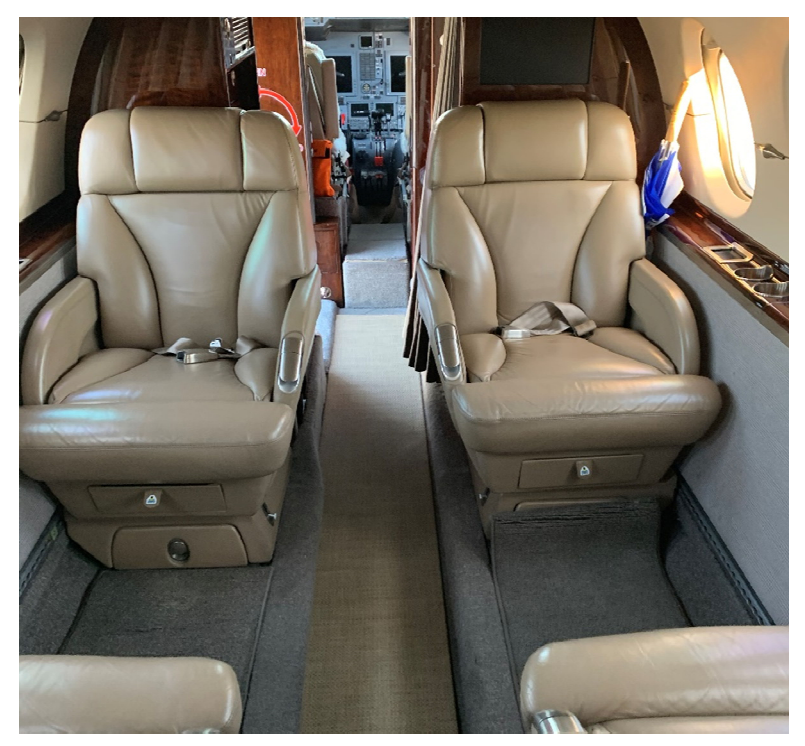
Forward Cabin looking Forward