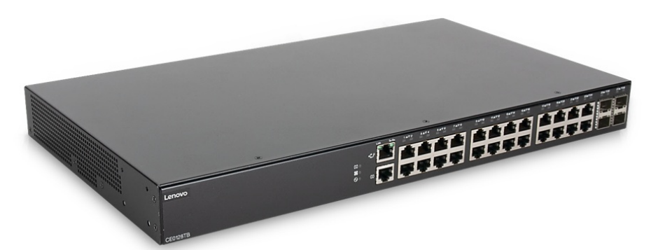
Figure 1. Lenovo CE0128TB Switch

The Lenovo CE0128TB Switch is shown in the following figure.