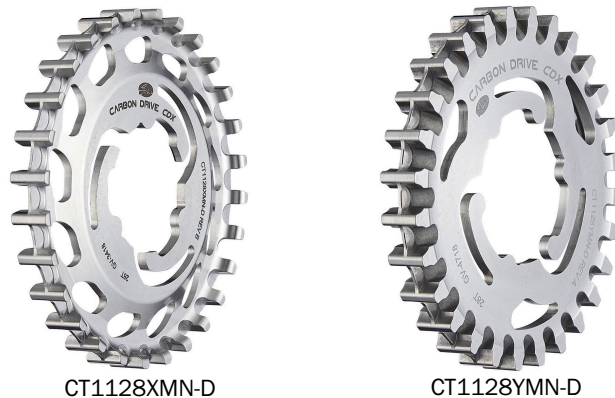
Figure 1: Di2 Specific rear offset sprockets.

It is important to note that not all belt drive compatible frames will work with the Shimano Di2 MU-UR500 system.