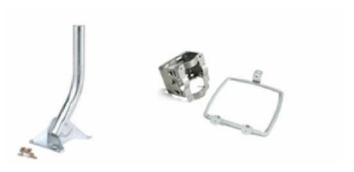
Figure 7. Cisco Aironet 1300 Series Mounting Hardware

In addition to the antennas available from Cisco, the Cisco 1300 Series has different mounting options (Figure 7). These optional mounting kits are available for mounting to a roof, wall, or pole. The quick-hang mounting bracket allows a simple one-person installation.