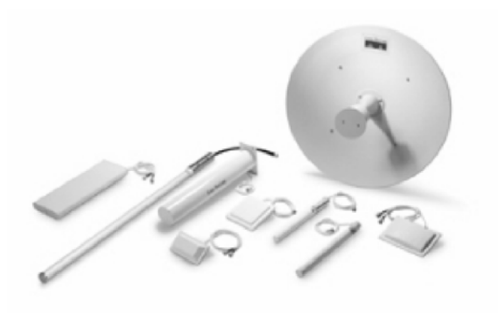
Figure 1. Cisco 2.4-GHz Antennas and Accessories

With the Cisco FCC-approved directional and omnidirectional antennas, low-loss cable, mounting hardware, and other accessories, installers can customize a wireless solution that meets the requirements of even the most challenging applications.