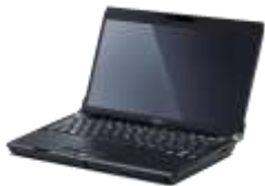
LIFEBOOK P Series

Take advantage of the growing network of wireless working and catch up emails where ever you are via optional embedded UMTS.