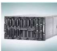
PRIMERGY BX600 S3

The PRIMERGY BX900 S1 is a rack unit that has an installed height of 10U and accommodates 1 to 18 server blades and 1 to 6 storage blades. The energy-efficient Intel Nehalem Quad-Core processors are used in the server blades. Ethernet, Fibre Channel and Infiniband networks are accessed via 8 switch bays. Switches from Cisco, Brocade and Emulex can be used. With its transfer rate of 6.4 Gb/s, the midplane used is the fastest on the market. 100V and 200V power supplies are available. This hardware platform is ideal for server consolidation and virtualization in the datacenter.