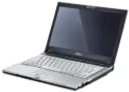
LIFEBOOK S Series

The LIFEBOOK S Series gives professional users the optimum combination of performance, modularity and flexibility: the functionality and ease of use of a desktop in a slimline, lightweight package. The integrated modem, network adapter, optional Bluetooth and wireless LAN are complemented by a multifunctional bay. The latest Intel Core 2Duo technology provide you long battery life away from the power socket.