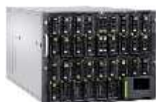
PRIMERGY BX900 S1

The PRIMERGY BX900 S1 is a rack unit that has an installed height of 10U and accommodates 1 to 18 server blades and 1 to 6 storage blades. The energy-efficient Intel Nehalem Quad-Core processors are used in the server blades. Ethernet, Fibre Channel and Infiniband networks are accessed via 8 switch bays. Switches from Cisco, Brocade and Emulex can be used. With its transfer rate of 6.4 Gb/s, the midplane used is the fastest on the market. 100V and 200V power supplies are available. This hardware platform is ideal for server consolidation and virtualization in the datacenter.