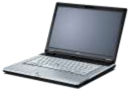
LIFEBOOK E Series

The LIFEBOOK S Series gives professional users the optimum combination of performance, modularity and flexibility: the functionality and ease of use of a desktop in a slimline, lightweight package. The integrated modem, network adapter, optional Bluetooth and wireless LAN are complemented by a multifunctional bay. The latest Intel Core 2Duo technology provide you long battery life away from the power socket.