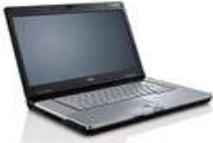
CELSIUS H Series

CELSIUS H Series. Powerful mobile workstation. If you run power-hungry 3D applications that demand no compromise on the graphics side, you'll appreciate the CELSIUS H. The system offers the power of a full-fledged workstation: Editing 3D OpenGL graphics in real time, running computer simulations and computing multimedia animations wherever you are.