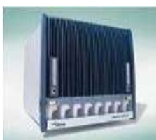
PRIMERGY BladeFrame BF200

The PRIMERGY SX940 S1 Direct Attached Storage Blade Disk can be used to extend the internal storage capacity of PRIMERGY BX92x Server Blades. A maximum of four internal disk drives greatly extends the maximum amount of disk storage of a Server Blade. One Storage Blade occupies a Blade slot within the PRIMERGY BX900 S1 system unit; it is positioned either on the left or right to an adjacent BX92x Server Blade, or between the two. The 1x 4 or 2x 2 disk drives of one SX940 S1 are driven by 1 or 2 integrated, highly functional SAS/RAID controllers with 512 Mbyte cache and BU. Each controller provides RAID levels 0, 1, 5 and 6. The connection to each Server Blade is realized via a midplane link to the high performing PCIe x4 interfaces of each Server Blade's system board.