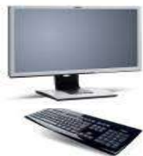
Displays & Peripherals

Computing power, memory space, graphics systems, expansion possibilities – even the most powerful of standard PCs are quick to reach their limits outside classic office and communication applications. Application fields such as simulation, animation, construction, and digital content creation require systems that offer maximum performance on all levels: CELSIUS workstations.