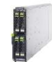
PRIMERGY SX940 S1

This storage blade for PRIMERGY BX600 offers an easy and cost effective opportunity for server consolidation. Rack and tower servers with high capacity of local hard disks are operating primarily in the area of small and medium enterprises. Very often it is essential having local access on large amounts of data; this for example applies to the wide area of Computer Aided Engineering (CAE), where smaller workgroups locally have to work on and create very large models. Operation within confined environments as file servers as well as for Microsoft SharePoint Servers and Microsoft SQL Servers are popular usage cases.