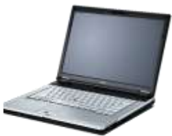
LIFEBOOK E Series

The LIFEBOOK S Series gives professional users the optimum combination of performance, modularity and flexibility: the functionality and ease of use of a desktop in a slimline, lightweight package. The integrated modem, network adapter, optional Bluetooth and wireless LAN are complemented by a multifunctional bay. The latest Intel Core 2Duo technology provide you long battery life away from the power socket.