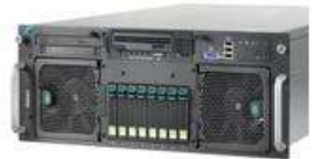
PRIMERGY RX600 S4

Corporate applications in data center server farms with central deployment and control demand increasing performance. The cost-efficient PRIMERGY RX330 S1 extends the PRIMERGY Rack portfolio and focuses rather on standard than on full feature set in comparison to RX300. RX330 S1 is offering enough local storage capacity to be used as a stand-alone AMD Opteron Quad-Core based application server and for server farms in scale-out environments with medium needs for