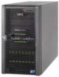
PRIMERGY TX200 S7

Do you want to access your workstation remotely? Then the CELSIUS RemoteAccess solution is the right choice for you. It enables you to separate your hardware from data input and output while keeping at the same time the real workstation user experience and performance. With the CELSIUS M470, CELSIUS R570 and CELSIUS R670 our offering of mid-range and high-end workstations got a refresh to meet highest demands.