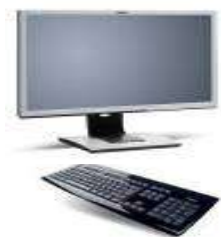
Displays & Peripherals

Positioned in three segments the Fujitsu displays offer the right model for every desire - from multifunctional all-rounders, advanced displays, which are highly ergonomic and comfortable, also for entertainment, and the superior class for highest demands in terms of performance, graphics and multimedia.