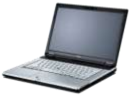
LIFEBOOK E Series

The LIFEBOOK S Series gives professional users the optimum combination of performance, modularity and flexibility: the functionality and ease of use of a desktop in a slimline, lightweight package. The integrated modem, network adapter, optional Bluetooth and wireless LAN are complemented by a multifunctional bay. The latest Intel Core 2Duo technology provide you long battery life away from the power socket.