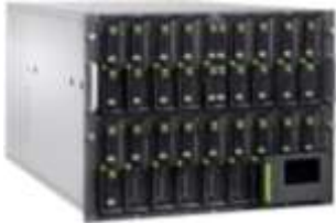
PRIMERGY BX900 S1

The PRIMERGY BX900 S1 is a rack unit that has an installed height of 10U and accommodates 1 to 18 server blades and 1 to 6 storage blades. The energy-efficient Intel Nehalem Quad-Core processors are used in the server blades. Ethernet, Fibre Channel and Infiniband networks are accessed via 8 switch bays. Switches from Cisco, Brocade and Emulex can be used. With its transfer rate of 6.4 Gb/s, the midplane used is the fastest on the market. 100V and 200V power supplies are available. This hardware platform is ideal for server consolidation and virtualization in the datacenter.