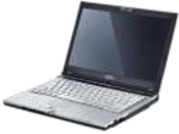
LIFEBOOK S Series

The LIFEBOOK S Series gives professional users the optimum combination of performance, modularity and flexibility: the functionality and ease of use of a desktop in a slimline, lightweight package. The integrated modem, network adapter, optional Bluetooth and wireless LAN are complemented by a multifunctional bay. The latest Intel Core 2Duo technology provide you long battery life away from the power socket.