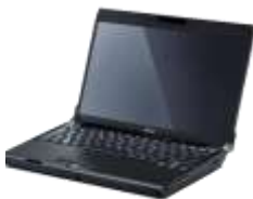
LIFEBOOK P Series

The LIFEBOOK E Series always follows a simple philosophy: only the best will do. Top notch performance with only 2.7 kg makes this notebook as one of the lightest in its class. The comprehensive security features, separate SmartCard reader, TPM and Fingerprint modules make your sensible data safe and secure – anytime, anywhere. Take advantage of the growing network of wireless working and catch up emails where ever you are via optional embedded UMTS.