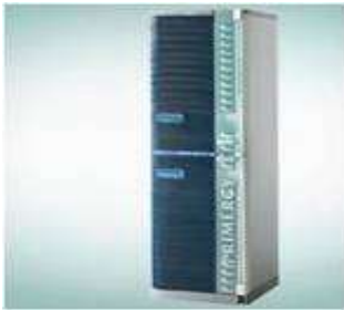
PRIMERGY BladeFrame BF400 S2

PRIMERGY BladeFrame is the platform to set up an application-independent and service-oriented IT infrastructure. The Processing Area Network (PAN) combines stateless servers (pBlades) with unique virtualization and management software, thus reducing the existing infrastructure complexity and providing a dynamic, high-availability system.