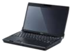
LIFEBOOK P Series

The LIFEBOOK E Series always follows a simple philosophy: only the best will do. Top notch performance with only 2.7 kg makes this notebook as one of the lightest in its class. The comprehensive security features, separate SmartCard reader, TPM and Fingerprint modules make your sensible data safe and secure – anytime, anywhere. Take advantage of the growing network of wireless working and catch up emails where ever you are via optional embedded UMTS.