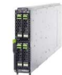
PRIMERGY SX940 S1

This storage blade for PRIMERGY BX600 offers an easy and cost effective opportunity for server consolidation. Rack and tower servers with high capacity of local hard disks are operating primarily in the area of small and medium enterprises. Very often it is essential having local access on large amounts of data; this for example applies to the wide area of Computer Aided Engineering (CAE), where smaller workgroups locally have to work on and create very large models. Operation within confined environments as file servers as well as for Microsoft SharePoint Servers and Microsoft SQL Servers are popular usage cases.