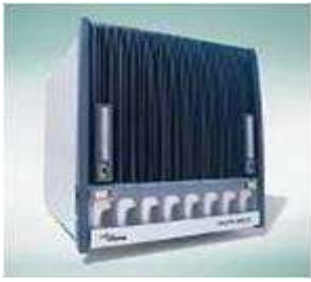
PRIMERGY BladeFrame BF200