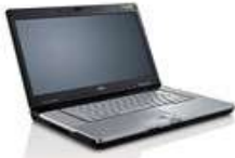
CELSIUS H Series

CELSIUS H Series. Powerful mobile workstation. If you run power-hungry 3D applications that demand no compromise on the graphics side, you'll appreciate the CELSIUS H. The system offers the power of a full-fledged workstation: Editing 3D OpenGL graphics in real time, running computer simulations and computing multimedia animations wherever you are.