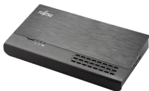
FUJITSU USB Type-C™ Port Replicator PR09