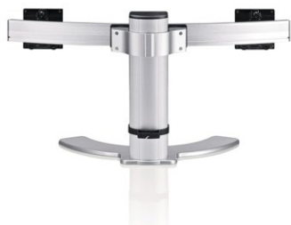
FUJITSU Dual Monitor Stand