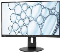
2x FUJITSU Display B24-9 TS

Application developers can use one screen for source coding and the other for real-time simulation to maximize project efficiency and reduce error.