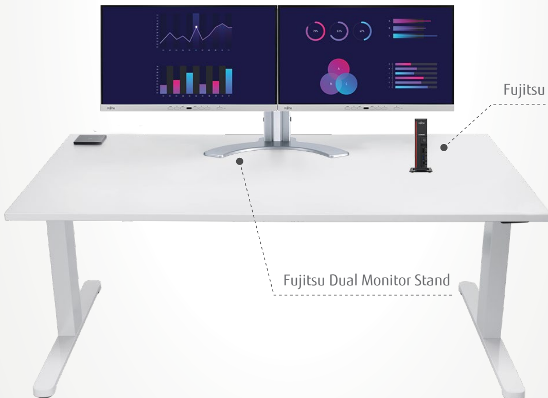
Fujitsu Dual Monitor Stand