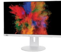
FUJITSU Display B24-9 TE