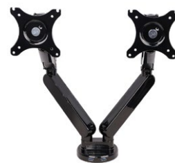
FUJITSU Monitor Arm