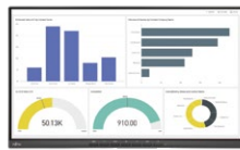
FUJITSU Display E24-9 Touch

The touch screen function enables direct editing of electronic documents, encouraging a green, paperless working environment.