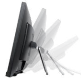
FUJITSU Display P24-9 TE