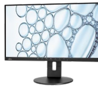
FUJITSU Display B24-9 TS