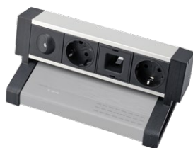
EVOLine Square Dock for PR09