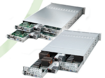
Twin Family 4DP Nodes in 2U 6x 3.5" HDDs per Node & 1U

Comprehensive Servers, Storage, Networking Product Lines Optimized for IT, Datacenter, HPC and Cloud Computing