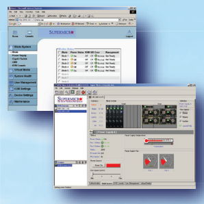
CMM IPMI View