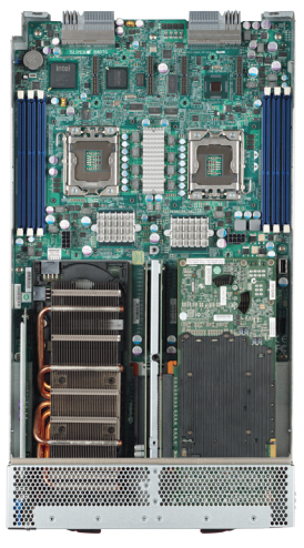
NEW! G34 4-way Opteron Blade for HPC & Enterprise