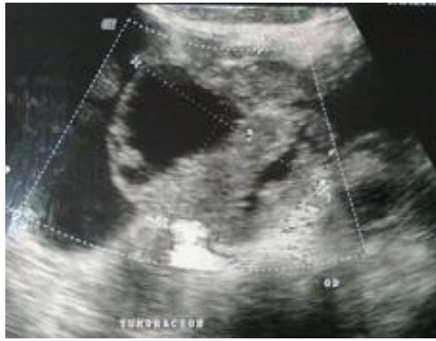
Figure 2: Ovarian tumor (likely dysgerminoma).