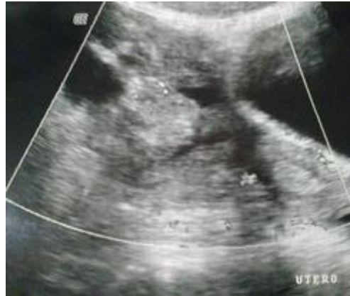
Figure 3: Right ovary tumor.