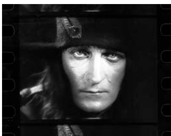
(Figure 1: frame scan)