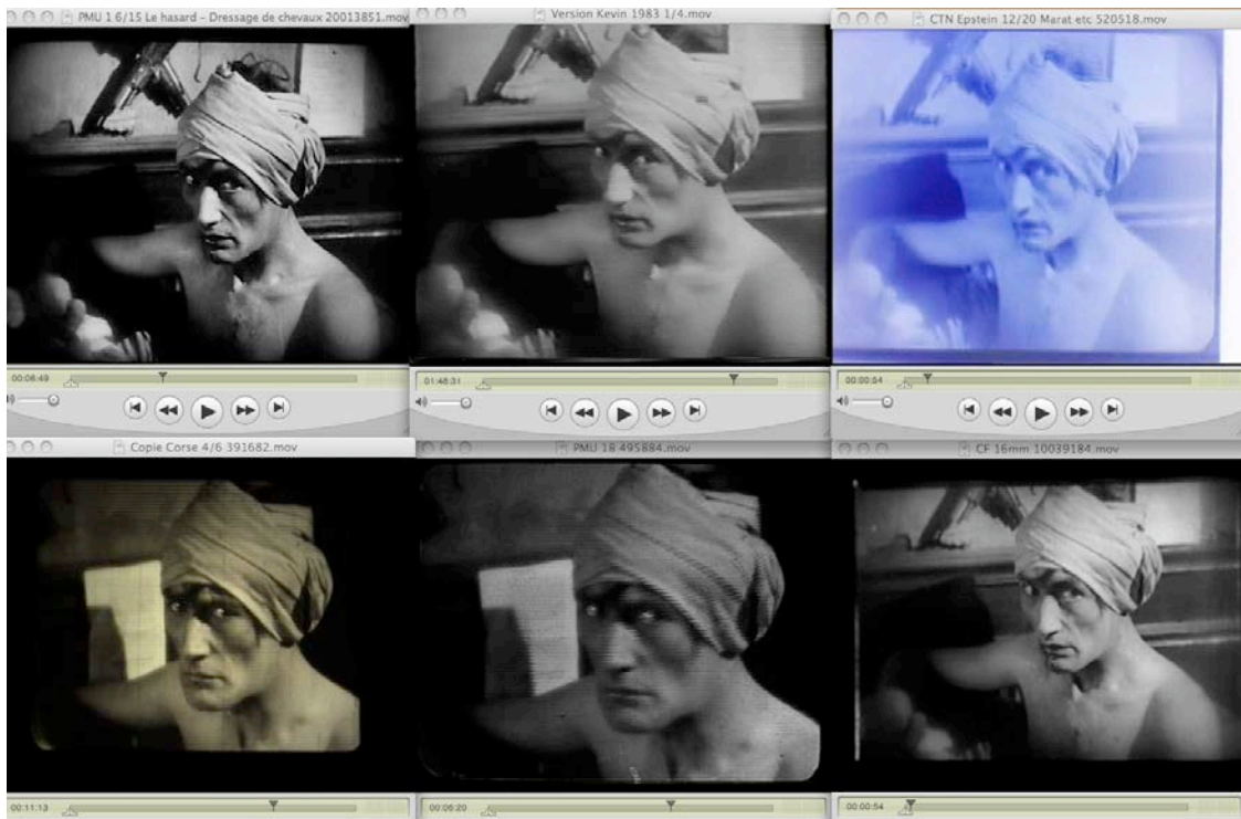
(Figure 9: Comparison of elements, utilizing DVD video captures: Antonin Artaud in the role of Marat)

This comprehensive, systematic, and simultaneous comparison, which until now had been impossible to do using a silver support, allowed us to clearly show: