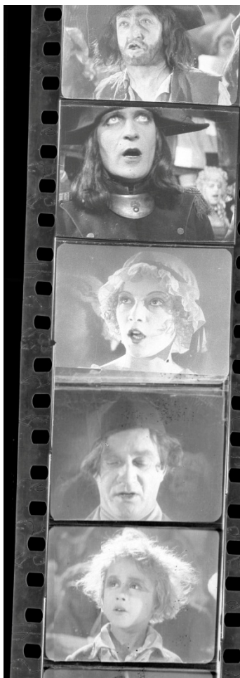
Above: (Figure 13: Geography lesson at Brienne: Apollo Version)

The character’s inner motivation is different and so is the artistic choice: it expresses one of Gance’s favorite psychological states, which he called “the memory of the future”.