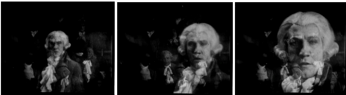
(Figure 11: Robespierre in the Apollo Version: dolly shot, up to Bonaparte)

In the Apollo Version, the ghosts appear to Bonaparte via dolly shots while asking their question. (Figure 11)