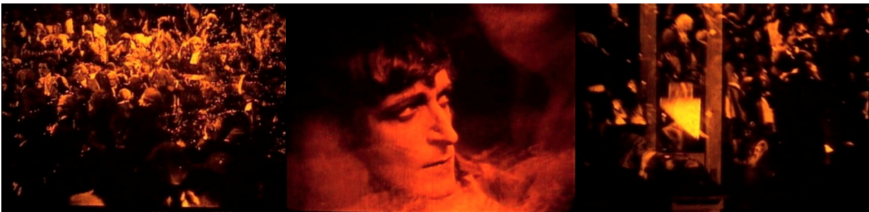
(Figure 15: The "Double Storm": Napoleon and the Convention. Photomontage recreating triple-screen triptych effect)

The title card preceding this shot paved the way for this effect: Bonaparte was indicated as a "tamer of oceans". We can give an idea of the desired effect with the following photomontage (Figure 15):