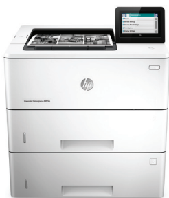
HP LaserJet Enterprise M506x