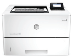
HP LaserJet Enterprise M506n

Finish key tasks faster with a printer that starts right away and helps conserve energy. 1 Multi-level device security helps protect from threats. Original HP Toner cartridges with JetIntelligence and this printer produce more high-quality pages. 2