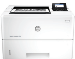
HP LaserJet Enterprise M506dn