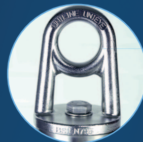
UNIEYE END ANCHORAGE CONNECTOR 316 stainless steel, electro-polished, serial numbered – 15,000lbs (67kN) min breaking strength.