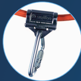
UNIGRAB ATTACHMENT DEVICE Weighs only 1.05lbs (0.45kg) and fits in the palm of your hand. Can be attached at any point along the system. 316 stainless steel, electro-polished and serial numbered.