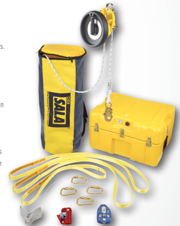
INDUSTRY ROOFING RESCUE & EVACUATION KIT

In many cases products offer cross functionality, which additionally reduces the need to carry multiple pieces of rescue equipment and saves money in both product and training.