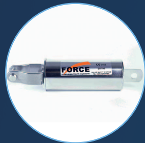
INLINE FORCE MANAGEMENT ENERGY ABSORBER 316 stainless steel, electro-polished.