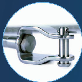
SWAGE END 316 stainless steel.