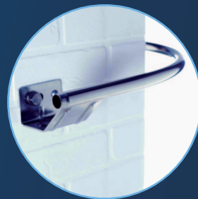
16MM 90° CORNER GUIDE 90 AND 45 DEGREE CORNERS 316 stainless steel, electro-polished. Other angles achieved using bespoke fabrications.