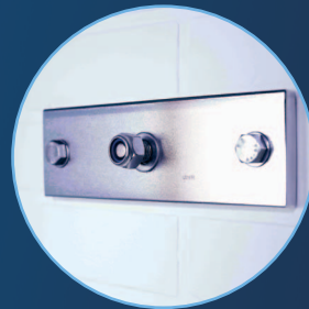
WALL ANCHOR PLATE 316 stainless steel, electro-polished. 11,240lbs (50kN) min breaking strength.